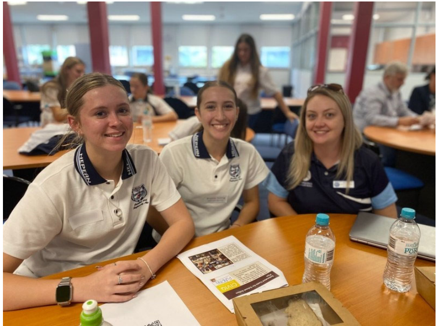
Nepean Creative and Performing Arts High School SALSA Peer Leaders and Coordinator.

Painted handball and volleyball courts, water refilling stations and sporting grounds with artificial turf are all ideas students from select western Sydney high schools recently brought to the table.